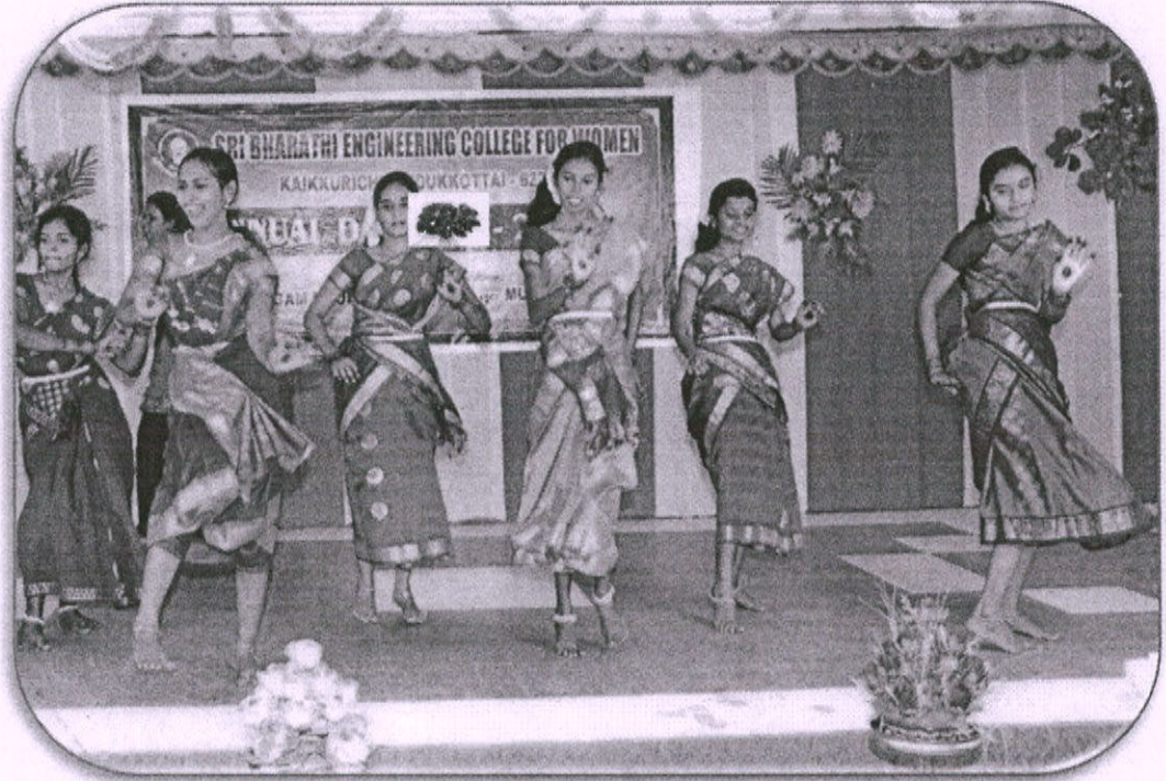
Annual Day celebrated on 13.06.2020.